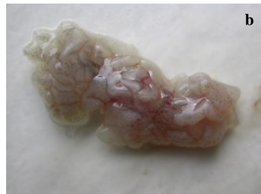
Figure 1. Gonads of the A. boyeri ( a: ovary, b: testis )