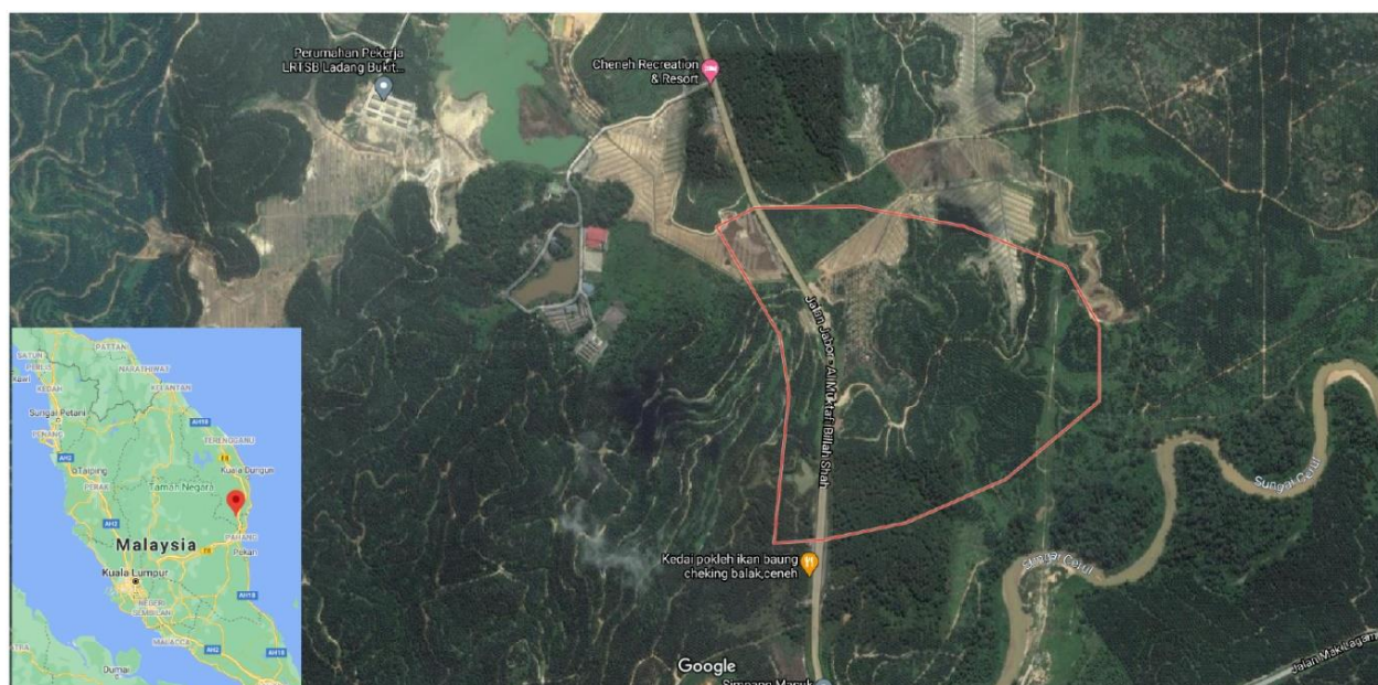
Figure 1. Leech sampling area (Cheneh, Terengganu, Malaysia)

All samples were prepared by acid digestion using a digestion solution which comprises a mixture of concentrated HNO 3 65% and a concentrated HCl 37%, in a ratio of (1:3) in 250 ml beakers (Uddin et al. , 2016). The digestion was completed by using water bath at 95°C for 8 hours.