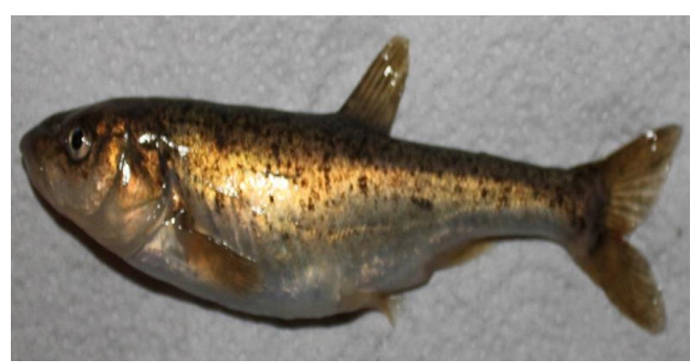
Figure 1. Popovo minnow (Delminichthys ghetaldii).

SDS PAGE was performed according to Laemmli (1970). Protein bands were separated on 1 mm thick slab gel comprised of 12% running gel and 5% stacking gel. Following the electrophoresis, gels were stained in Coomassie brilliant blue (0.1%), acetic acid (10%) and methanol (50%) and destained in mixture of 5% methanol and 7% acetic acid. Each analysis was performed in 5 replicates. Molecular weight (MW) of protein was determined using Prestained Rec Protein Ladder by Fisher Reagents. TotalLab software was used for the analysis of quantitative and qualitative distribution of protein bands.