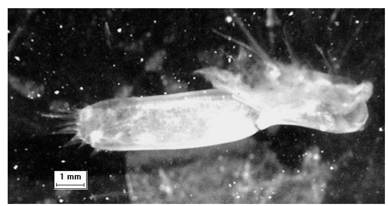
Figure 2. Appendix masculina of a N. norvegicus male individual

using Student's t-test (Sokal and Rohlf, 1981). The comparison of the appendages' slopes b and carapace length between the sampling months was carried out by one-way ANOVA. All the above statistics were applied using STATGRAPHICS Plus software. Statistical significance was indicated by P<0.05.