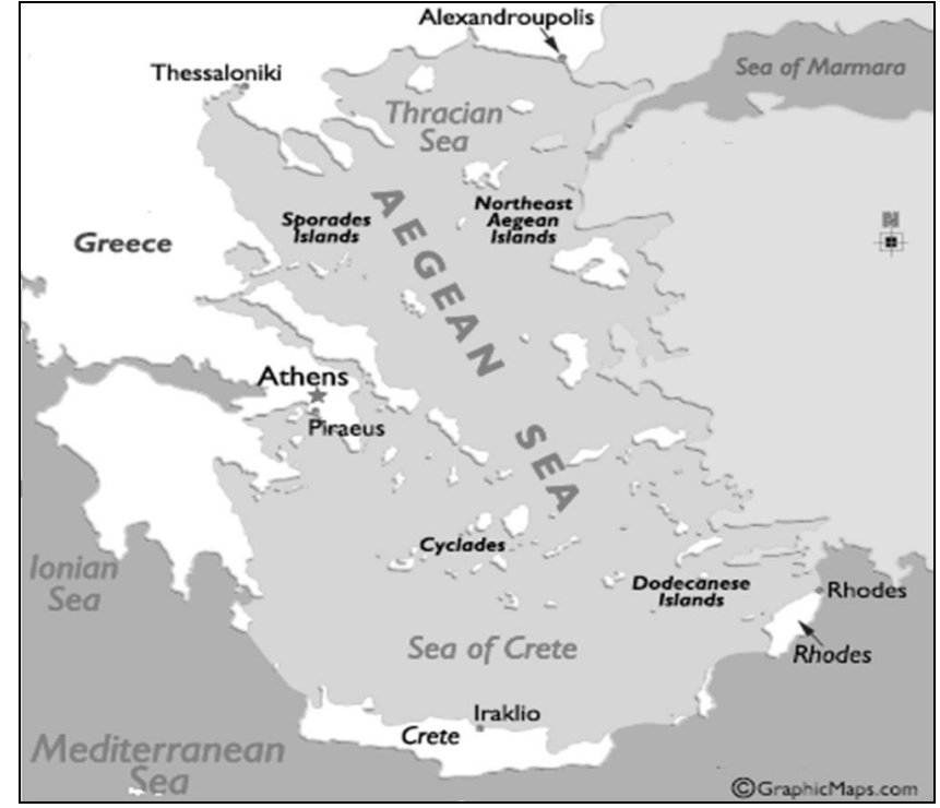
Figure 1. Sampling area.

The second pleopods were removed at the base to ensure the intact removal of the endopodite and the appendix masculina. The pleopods were stored in 70% alcohol and the total surface and the perimeter of the appendix masculina of mature males (Stage II) were estimated based on the images taken from that body part using the Image analysis Pro Plus software (Figure 2). The perimeter and surface measurements were given in mm and mm<sup>2</sup>, respectively. The relationships between the appendices' surfaces vs. CL and among the appendices in each species were studied using the linearized allometric model, log y=log a + b log x, which has a slope of b, the allometric growth constant. If b>1, then the dimension y increases relatively more rapidly than does the reference dimension x, and the growth is considered as positively allometric. Otherwise, b<1 indicates negative allometry, and b=1 indicates a condition of isometry. The type of allometry was determined by testing the slope (b) of the obtained regression equations against the isometric slope of 1