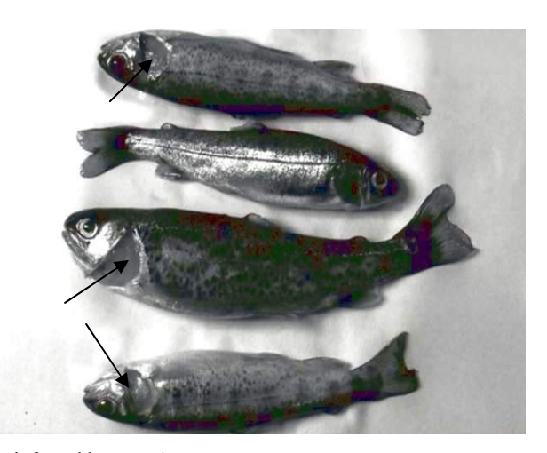
Figure 1. Gill lesions of rainbow trout infected by F. columnare .

Colonies developed from the internal organs at 25°C in 48 and 72 hours resulted in growth of usually pale yellow flat, rather small and had rhizoid edges and tended to adhere to the cytophaga agar. The isolated bacteria were Gram negative slender and rather long bacilli. In wet preparation, the bacteria showed a slow gliding movement and characteristic of column-like masses (Figure 2).