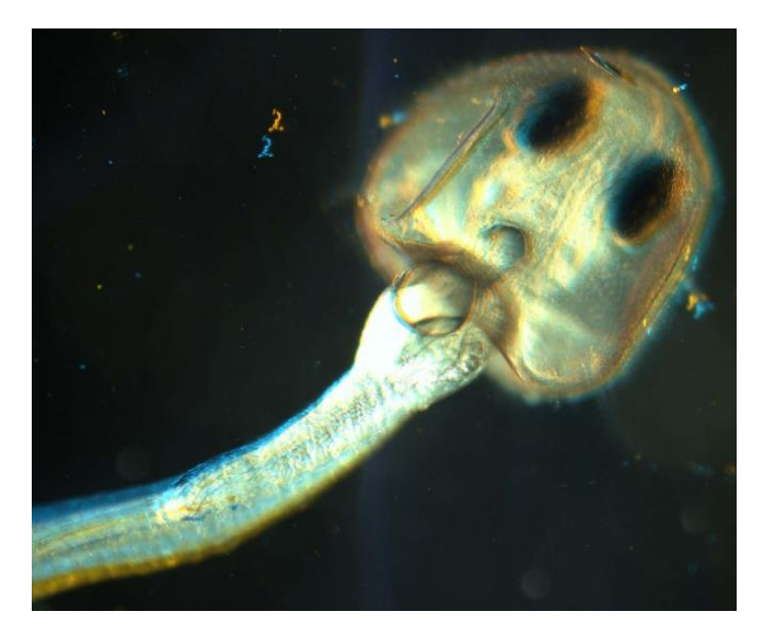
Figure 2. Remained egg shell cover on the head of newly hatched larvae in tannic acid treatment.

Tannic acid and enzymes act through chemical reactions between the substances and egg envelope structure, but milk acts mostly by physical binding of milk fat to the sticky surface of egg shell, neutralising adhesiveness. Achieved hatching rate was similar to enzyme treatment (Table 1.).However, as mentioned earlier, remnant stickiness was observed in this treatment even though the stickiness elimination