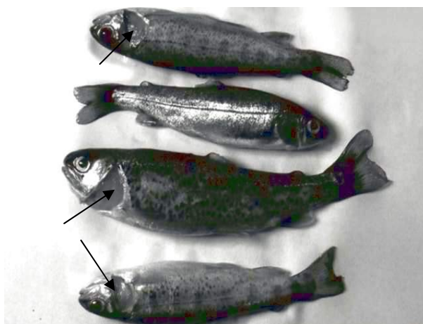
Figure 1. Gill lesions of rainbow trout infected by F. columnare .

Colonies developed from the internal organs at 25°C in 48 and 72 hours resulted in growth of usually pale yellow flat, rather small and had rhizoid edges and tended to adhere to the cytophaga agar. The isolated bacteria were Gram negative slender and rather long bacilli. In wet preparation, the bacteria showed a slow gliding movement and characteristic of column-like masses (Figure 2).