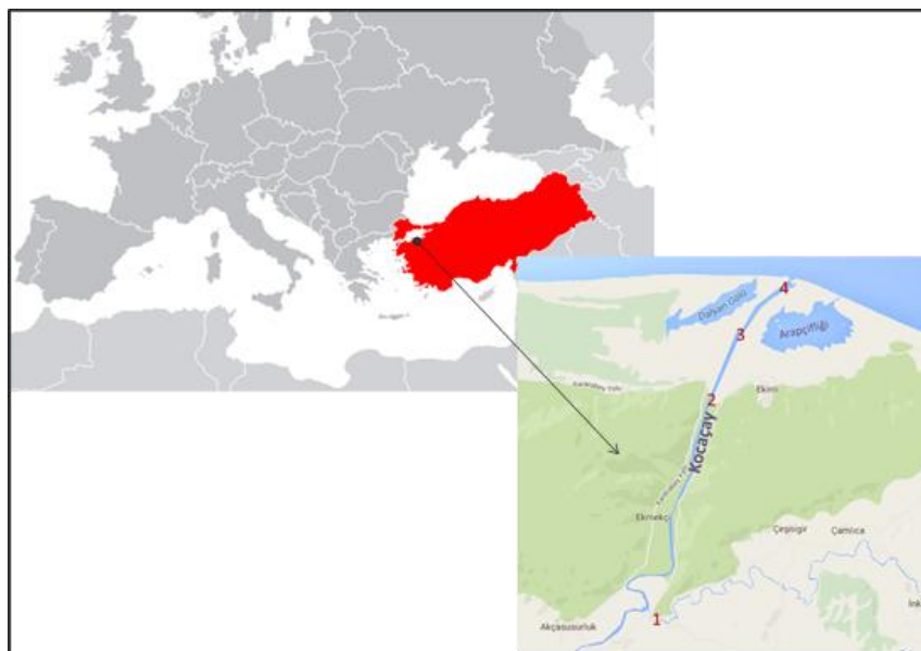
Figure 1. Sampling Area (Akbulut & Tavşanoğlu 2015).

To investigate the zooplankton species composition, samples were collected by vertical haul using a standard plankton net of 44 µm mesh size from 4 different stations (Figure 1; Table 1). Zooplankton samples were fixed in Lugol's solution (4%). The zooplankton species were identified as possible as species level under the binocular microscope (Leica DM5000B). Among zooplankton, Cladocera and Copepoda were identified according to Scourfield & Harding (1966), Kiefer (1978), Reddy Ranga (1994), Smirnov (1996), Flößner (2000), and Dussart & Defaye (2001). Rotifers were identified according to Emir, (1994), Koste, (1978), Ruttner-Kolisko, (1974), Segers, (1995), Nogrady & Paurriot, (1995), De Smet, (1996), De Smet & Paurriot, (1997), De Smet (1998). Zooplankton taxa were divided into different functional groups into feeding guilds (Barnett, Finlay, & Beisner, 2007, Obertegger & Manca, 2011; Bertani, Ferrari, & Rosetti, 2012; Lokko & Virro, 2014). The Guild Ratio was calculated as GR = \frac{\text{biomass raptorial-biomass}}