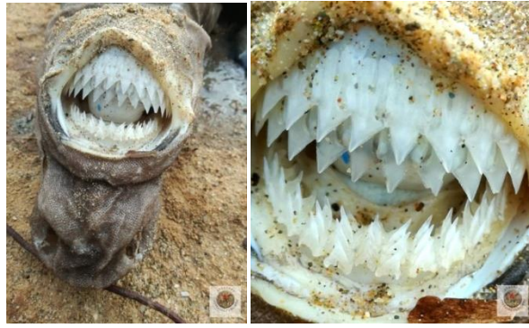
Figure 2. Head images of the stranded female kitefin shark showing its characteristic teeth rows