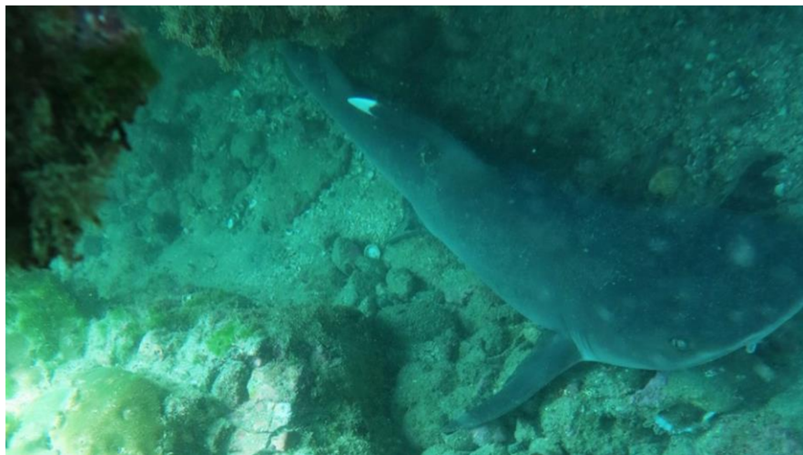
Figure 2. Whitetip reef shark in a rocky reef at El Barrote, BCS, Mexico.