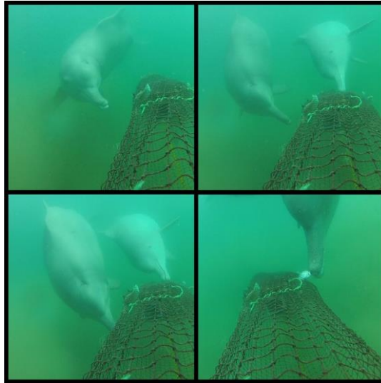
Figure 3. Humpback dolphins ( Sousa spp. ) on 25 April 2016. They were seen to feed “gently” on simultaneously with codend escapees.

dolphin ( Sousa plumbea ). In addition, easily seen wide hump (Figure 2c) and long beak (Figure 3) which are the morphological characteristics of the Indian Ocean humpback dolphin may support this identification.