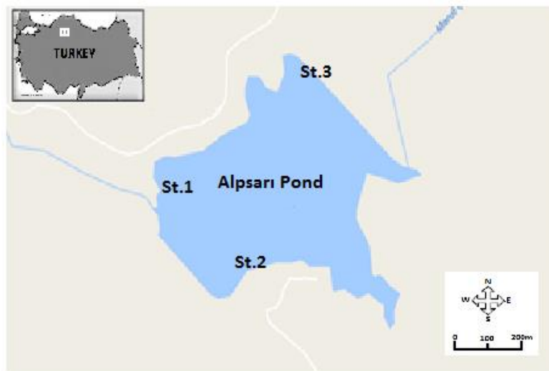
Figure 1. Map of study area with sampling point locations.