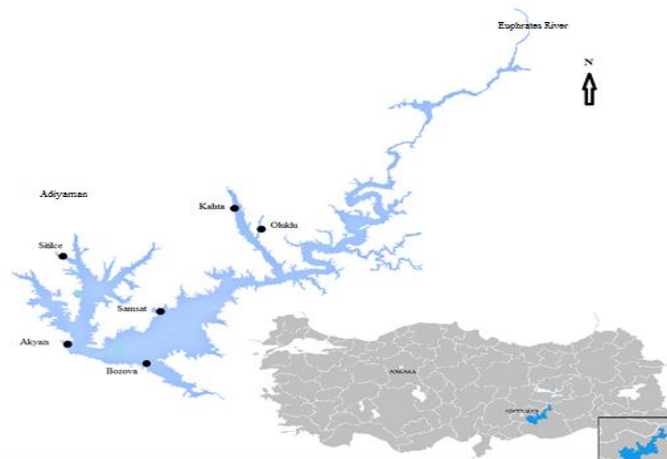
Figure 1. The studied sites (Kahta, Oluklu, Samsat, Sitalce, Akyazi, Bozova) in the Ataturk Dam Lake, Turkey.

The standard pesticides were gotten from Sigma-Aldrich with 96.7% purity. Extraction of water samples was done following the method defined by Osibanjo and Adeyeye (1997). A rotary evaporator was used to intensify the extract to 10 ml at 45°C. The extract was dropped off 1 ml under nitrogen gas at 50°C and transferred into vial. The sediment samples were extracted according to Ize-Iyamu et al. (2007). The 20 g of anhydrous Sodium sulphate and 10 g of sediment was crushed powder using a mortar. The extraction of crushed sample was done with 150 ml of a mixture of n-Hexane and Acetone (1:2). The extract was concentrated to 20 ml in a water bath protected