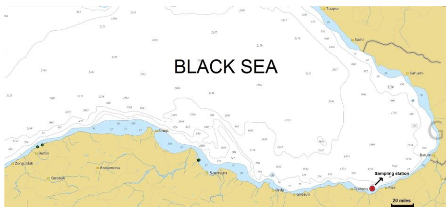
Figure 1. Sampling station in the Southeastern Black Sea.

The study was performed in the Southern part of the Black Sea at a coastal station with coordinates 40° 57' 12" N - 40° 9' 30" E (Figure 1). N. scintillans samples were collected with a 200 µm mesh Hydro-Bios net with a mouth diameter of 110 cm. The vertical haul was used from the entire oxic layer