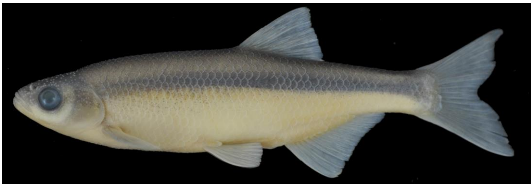
Figure 5. Alburnus escherichii about 178 mm SL, Üstünler Stream (Beşşehir Lake basin) (IFC-ESUF 03-0372).

Sakarya River drainage, both having fewer numbers of lateral line scales 44 (1), 45 (2), 46 (10), 47 (7) and 48 (5) in A. nasreddini ; 46 (1), 47 (7), 48 (4), 49 (3), 50 (1), 51 (1) and 53 (1) in A. escherichii .