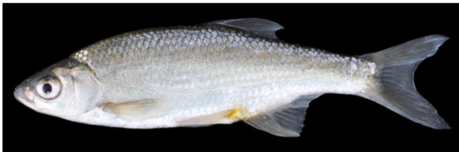
Figure 2. A. nasreddini about 109 mm SL, Selevir Reservoir (alive colour) (IFC-ESUF 03-0373).