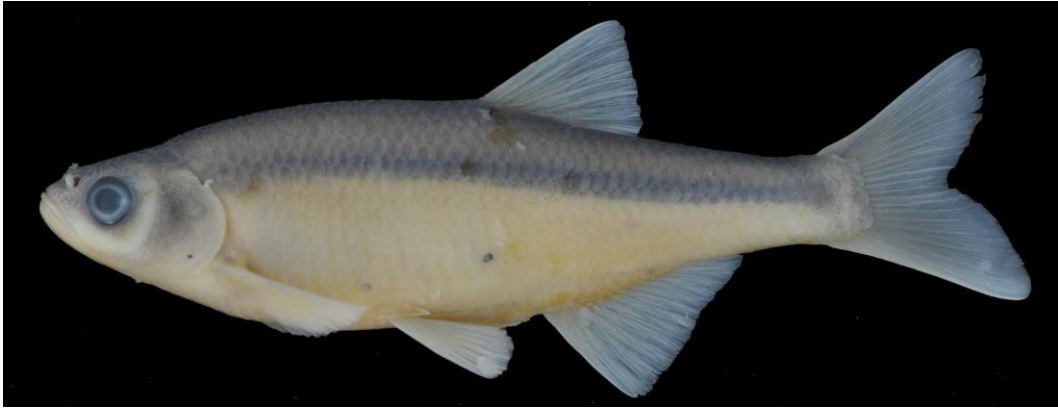
Figure 3. A. nasreddini about 103 mm SL, Selevir Reservoir (fixed specimen) (IFC-ESUF 03-0373).