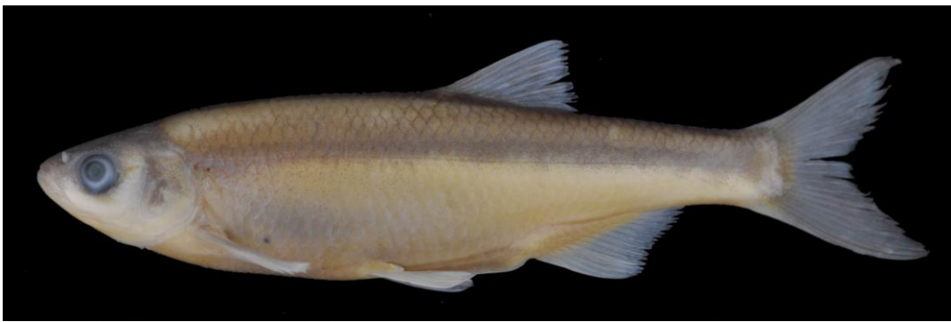
Figure 4. Alburnus escherichii about 130 mm SL, Yörükçırka, Porsuk Stream (IFC-ESUF 03-0335).