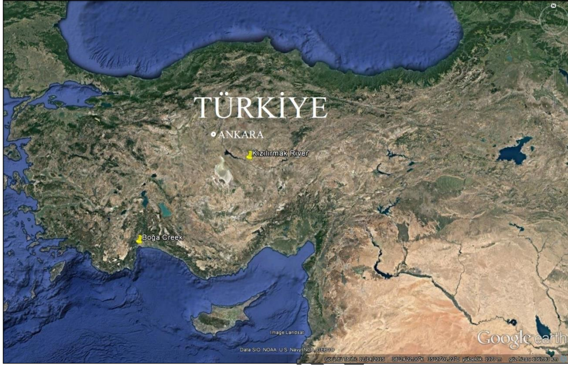
Figure 1. Map shows the sampling sites.