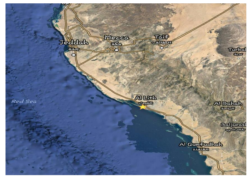
Figure 1. Map of the studied site (Google map).

The data were analyzed using t-test analysis to compare the bioremediation capacity between infected and non-infected fish. The differences in heavy metal concentrations between non-infected and infected tissues, and parasites species were tested separately. For comparing two independent groups, Independent sample t-test was used. The mean metal concentration \times 1/ dry- weight for sample was used to calculate the capacity of metal concentration mg/L and then the equation (mineral concentration capacity×25)/1000 was used for calculating the capacity of mineral concentration mg/g (25 volume of